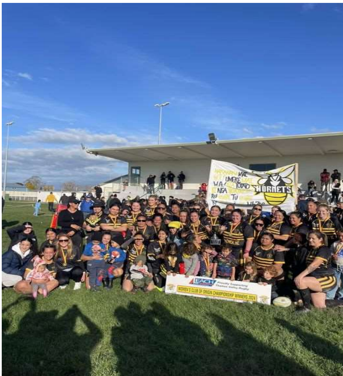
Congratulations to Coromandel for taking out the Women's' Club of Origin championship.

It has been great to see the two preseason games against New Zealand Harlequins and the North Harbour B Team. Both teams faced were strong teams with two great games resulting. For all our representative teams the many games are taking place all around the North Island. The age grade teams have a very busy schedule of matches for both women/girls along with the various boys teams. I must state how it also great to see the various coaching/management groups offering to assist as well. For me personally it is always fantastic to see some of our ex-players offering to assist with coaching and managing of the many teams.