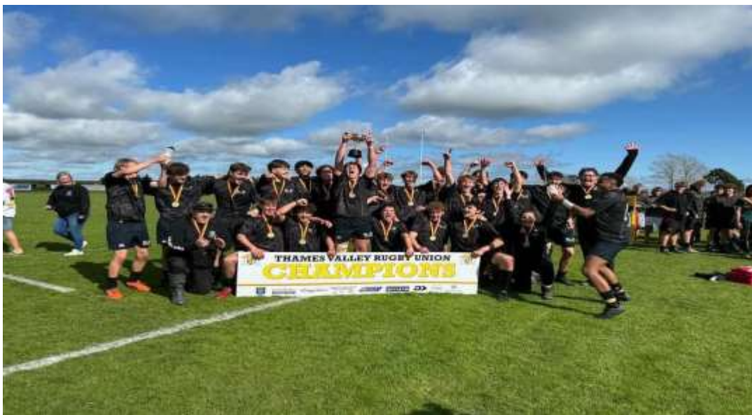
Thames Valley Secondary Schools Champion Boys First XV Winners -Hauraki College.