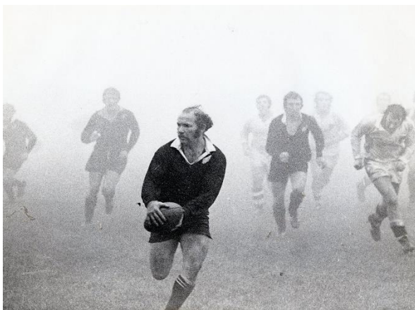
Brian, Ken and Sid Going