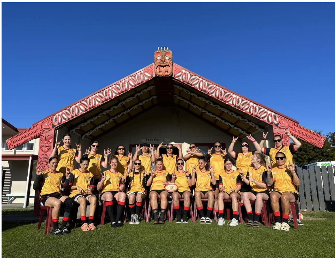
Thames Valley Vixens on tour in 2023.